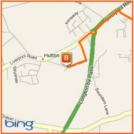
From M6 junction 29