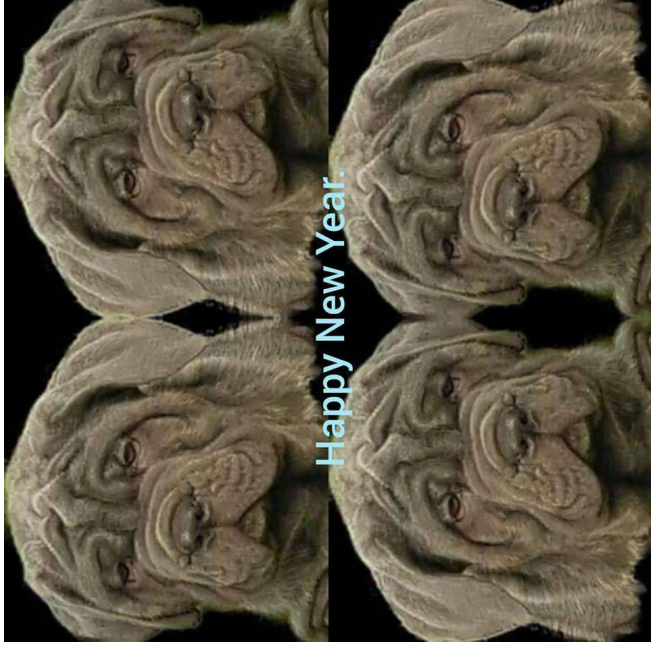
PUPPIES BRED BY MIKE & MANDY EVANS (MAKAEVO)

Parents: please keep your children under control